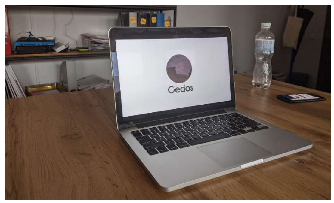
nammi design atelier presents the new Cedos's identity for the first time in July 2020

initiatives and government bodies in Podilsky District aimed at establishing contacts and developing cooperation.