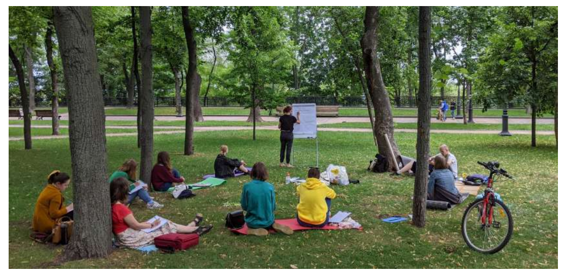
Cedos strategic session on Volodymyrska Hirka in July 2020