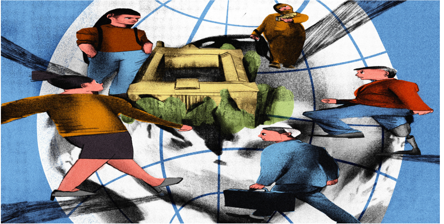
Illustration by Zhenya Polosina for the presentation and discussion of the results of the study “Foreign students in Ukraine: (in) coherence of policies”