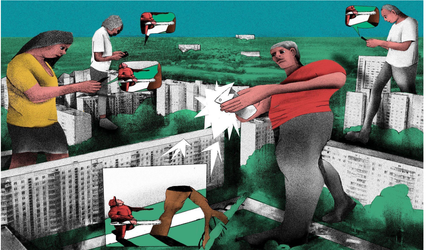
Illustration by Zhenya Polosina to the research report "Strategies, goals and activities of urban social movements in Kharkiv. Analysis of virtual communities in the Industrial District (Kharkiv Tractor Plant)"