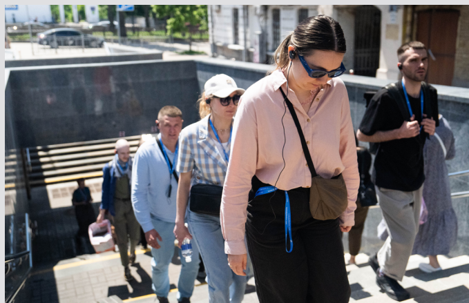
Cedos School: "Housing Policy in Ukraine", May 2025.