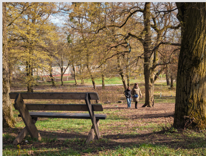
Park in Ostroh, autumn 2025.

cities on their path to climate neutrality . During 2025, we worked on developing a capacity-building program for 12 flagship municipalities, namely Chernihiv, Chernivtsi, Dnipro, Kalush, Kharkiv, Konotop, Kyiv, Mykolaiv, Novovolynsk, Pervomaisk, Vinnytsia, and Zviahel. We also adapted the SNAP (Support Needs Assessment Process) methodology to the Ukrainian context and began facilitating exchanges between city partnerships Pervomaisk–Parma, Dnipro–Budapest, and Chernivtsi–Mannheim.