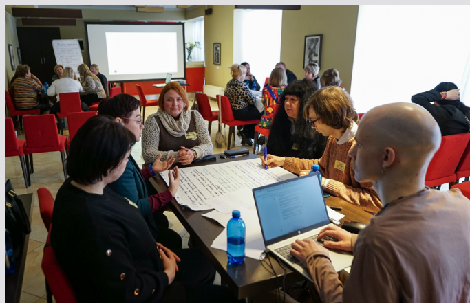
Event "Housing and Social Protection in Frontline Hromadas", February 2025.

In addition, Cedos experts contributed to the preparation of the report by the