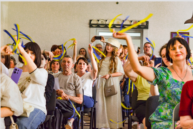
Opening of a community center in the village of Vikno, Ternopil region, July 2025.

We continued to promote the importance of fair and sustainable urban and local development. In Lutsk, the seventh Ukrainian Urban Forum, Human Scale, took place, bringing together around 350 participants. During the event, we discussed how sustainable institutions, people-centered urban policies, and accessible infrastructure can contribute to social development and overcoming inequalities. Together, we looked