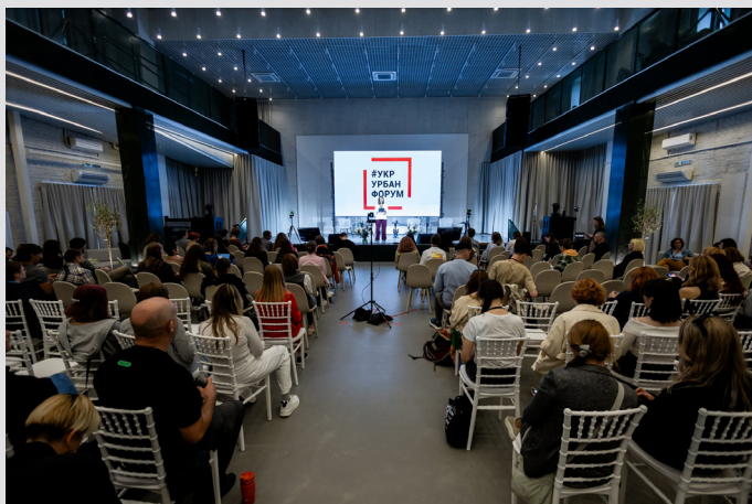
Opening of the Ukrainian Urban Forum 2025 in Lutsk.

for answers to the questions of how to mitigate the consequences of war and demographic challenges, how to strengthen human potential and ensure residents' access to housing,